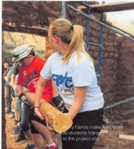
Many hands make light work as students transport beams to the project site.