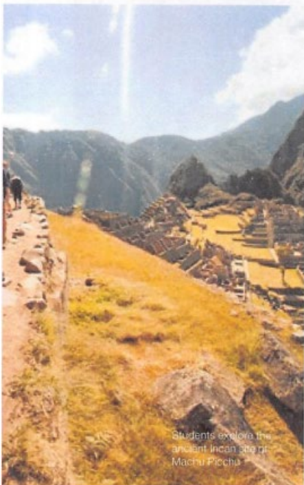
Students explore the ancient Inca site of Machu Picchu.