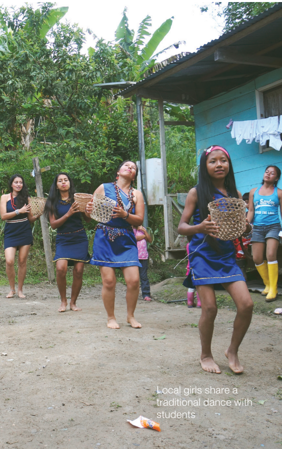
Local girls share a traditional dance with students