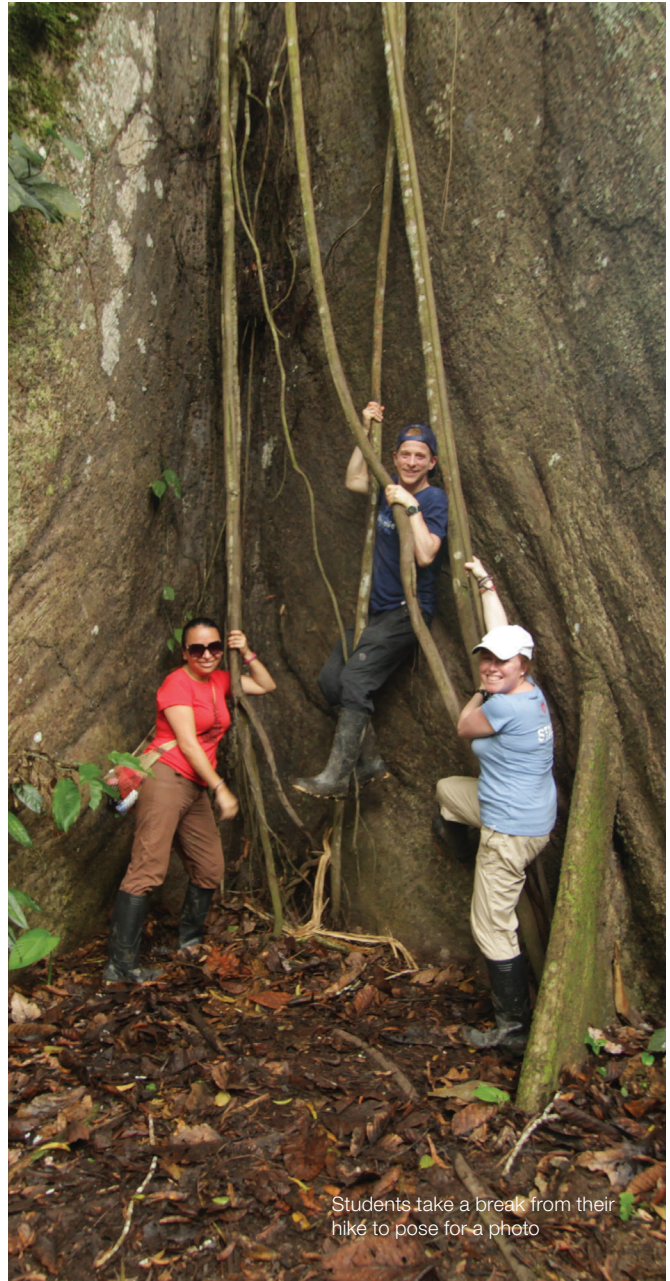
Students take a break from their hike to pose for a photo