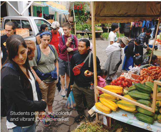
Students peruse the colorful and vibrant Otavalo market