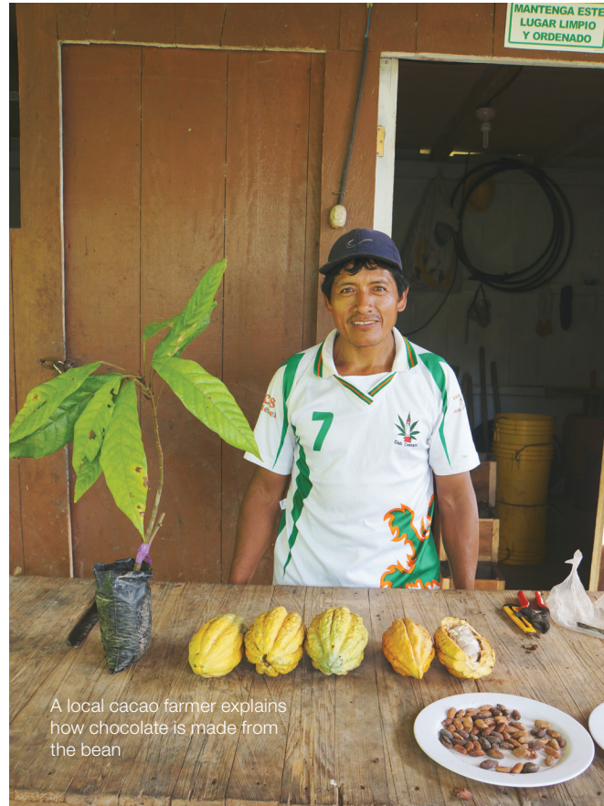
A local cacao farmer explains how chocolate is made from the bean