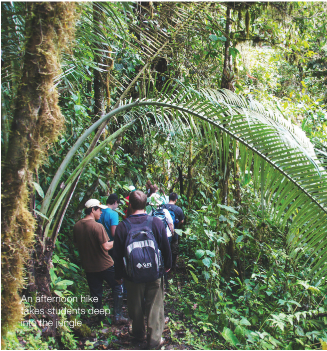
An afternoon hike takes students deep into the jungle