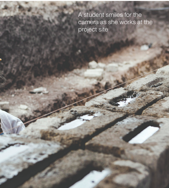
A student smiles for the camera as she works at the project site